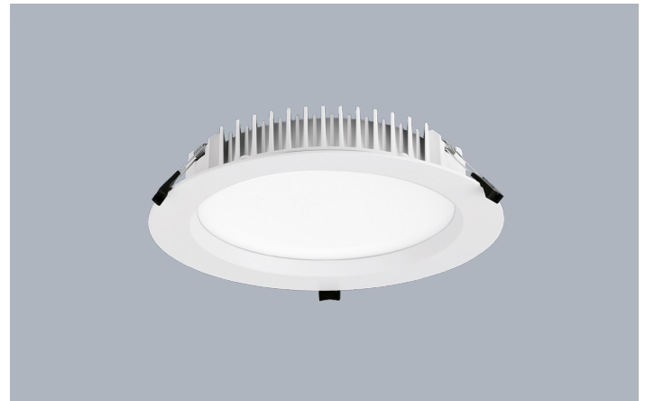
Lumi-Fit™ 45W High Performance Dimmable LED Downlight